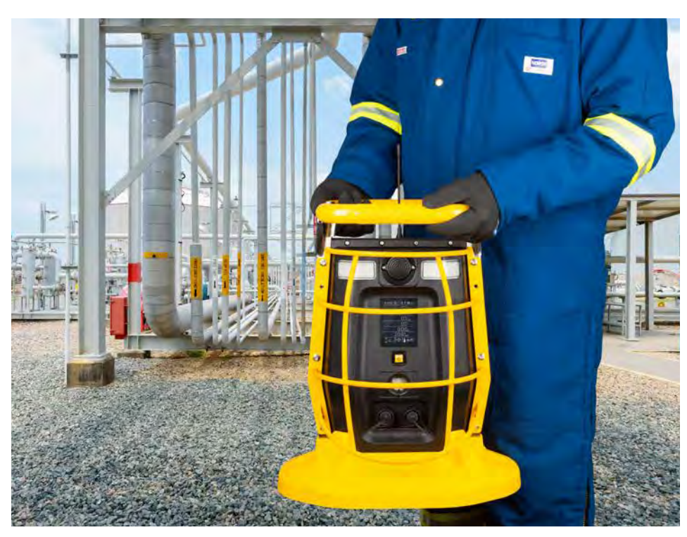
Grab and go. Like other Honeywell BW products, Honeywell BW RigRat is engineered for ease, with one-button operation. Simply turn it on and it's ready to deploy — no expertise required. Convenient handles and a carrying strap make it easy to take with you.